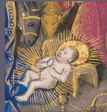
(details) The Nativity, Fauquier Hours, f. 49v France, Besançon or Amiens (?), c. 1420- 1440, 137 ff. , 180 x 130 (105 x 70) mm