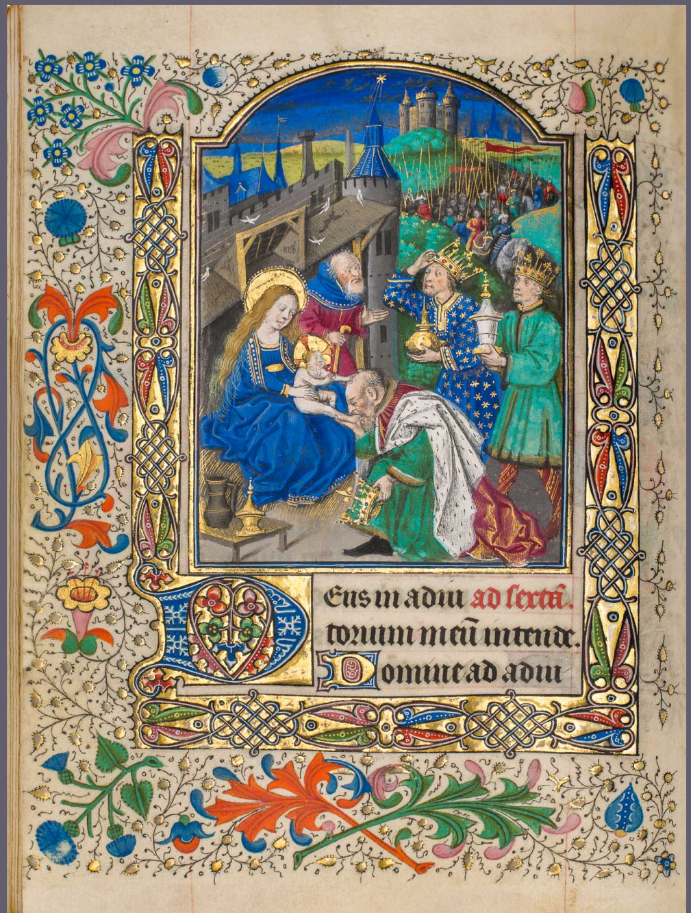
Adoration by the Magi, f. 52v France, Besançon or Amiens (?), c. 1420- 1440, 137 ff. , 180 x 130 (105 x 70) mm

The Evangelist Matthew tells the story in his Gospel 2:1-22