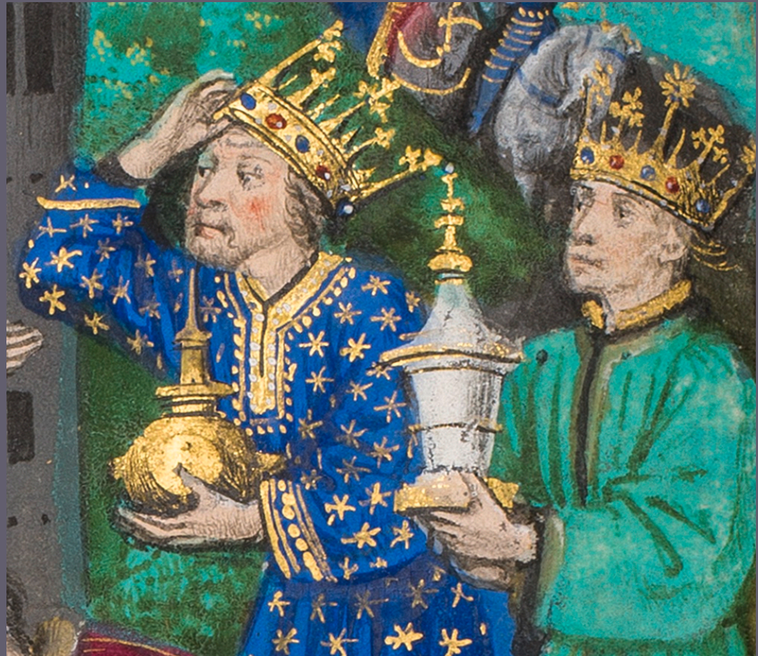
Golden gifts contrast with the Holy Family's simple jug.