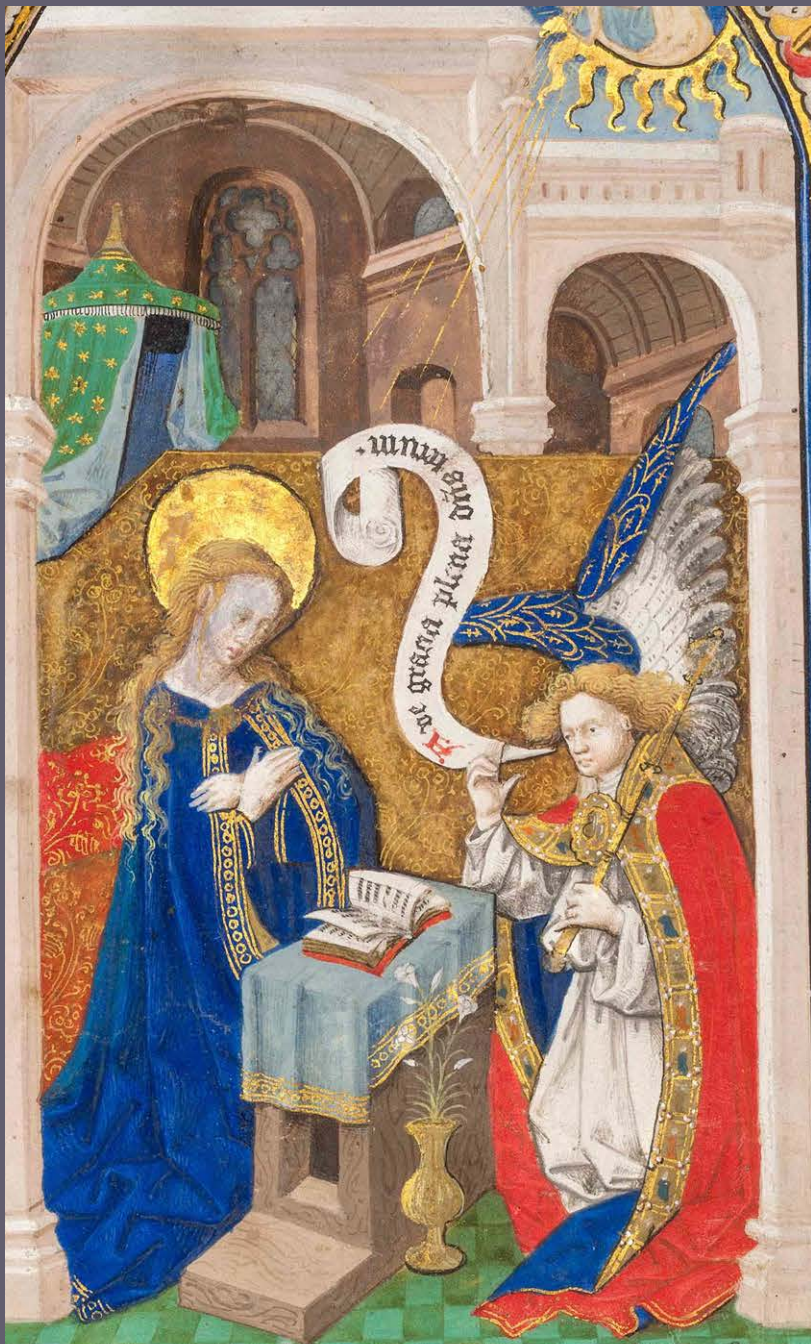
Annunciation, Full-page miniature painted by Jehan Haincelin, also known as the Dunois Master, Paris, c. 1440

The Archangel Gabriel, messenger from God, kneels before the Virgin. He is richly dressed in a red cape trimmed with gold brocade and gems, closed by a large jewelled clasp. Mary, modest and devout, kneels at her lectern before her open prayer book. Above, the Holy Spirit descends in golden beams.