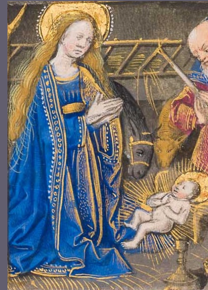
Golden light, (Detail) The Nativity, Fauquier Hours, f. 49v France, Besançon or Amiens (?), c. 1420-1440, 137 ff. , 180 x 130 (105 x 70) mm

As Christ is the light of the world, no candle is needed.