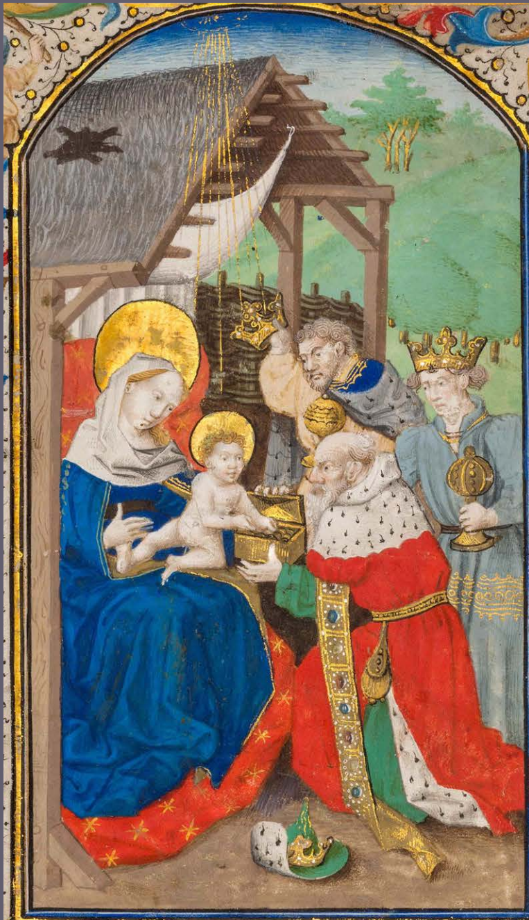
The Adoration of the Magi and the Flight into Egypt by the Dunois Master show minutely rendered details of clothing and landscape.