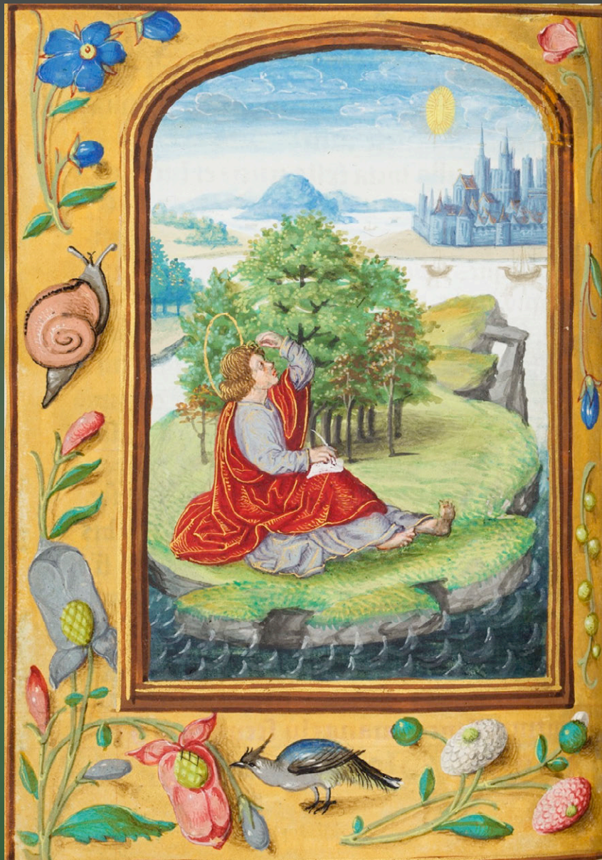
Agrostemma githago – Corncockle