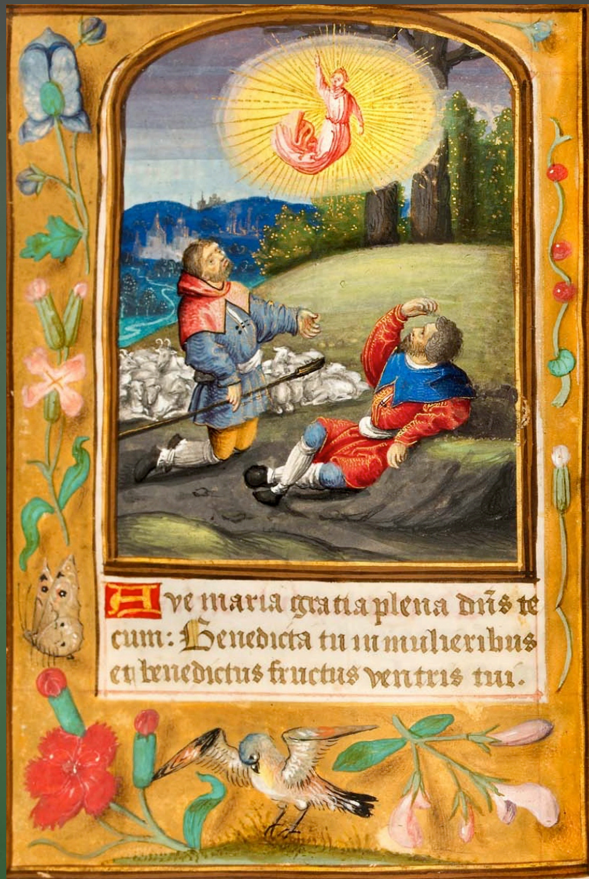
f. 49v: Annunciation to the Shepherds, Book of Hours, Southern Netherlands, Cambrai, c. 1520

A blue iris, pink and red carnation, and a primrose