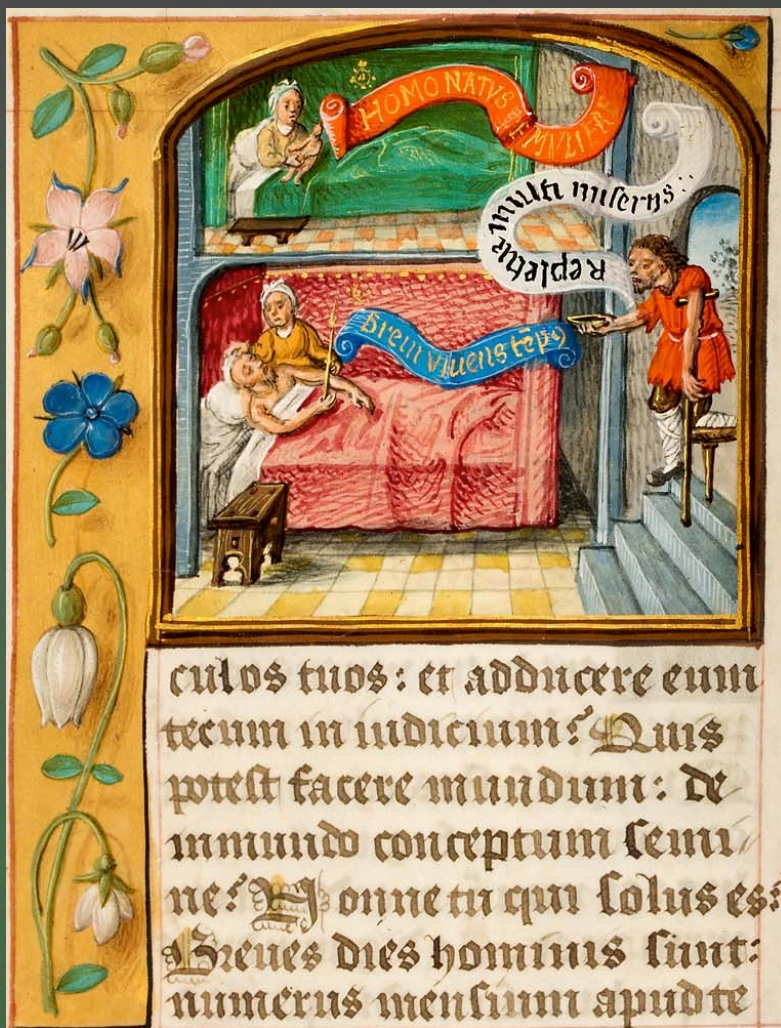
f. 113v: Mercy between Birth and Death at Lesson 5 (text: Job 14,1), all in a 'two- storey' room