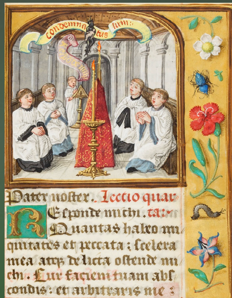
f. 107v: Funeral service at Lesson 4, Responde mihi. Condemnatus sum, Answer me! I am condemned.