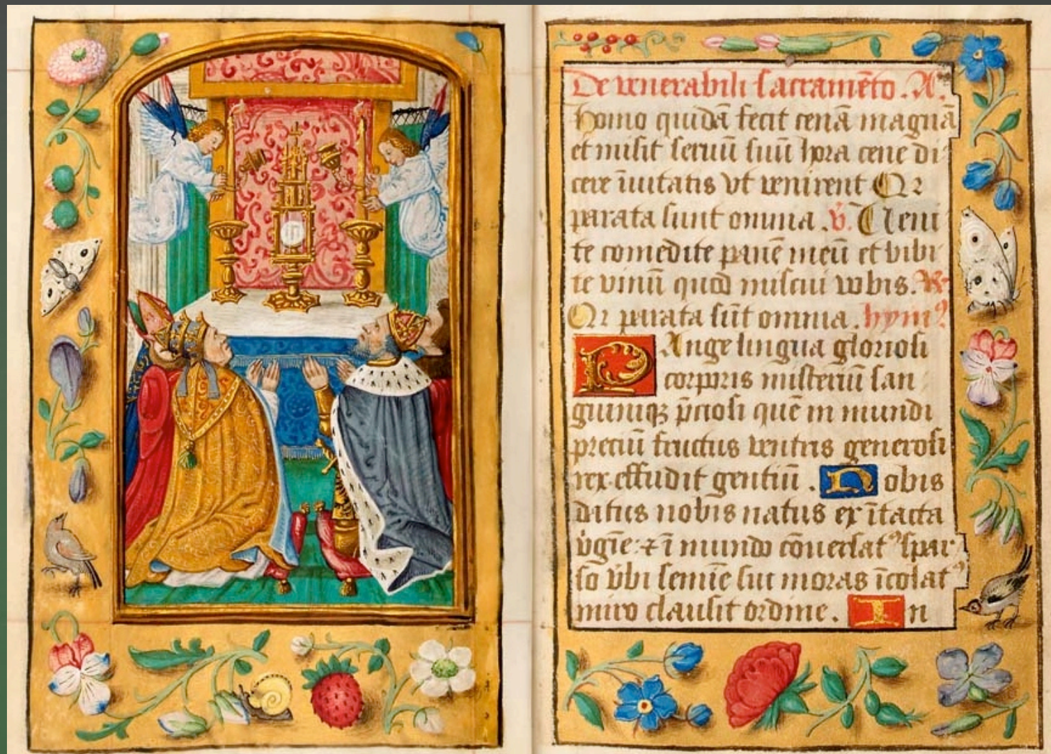
ff. 209v-210r: Adoration of the Holy Sacrament by a pope, emperor, bishop, and layman.