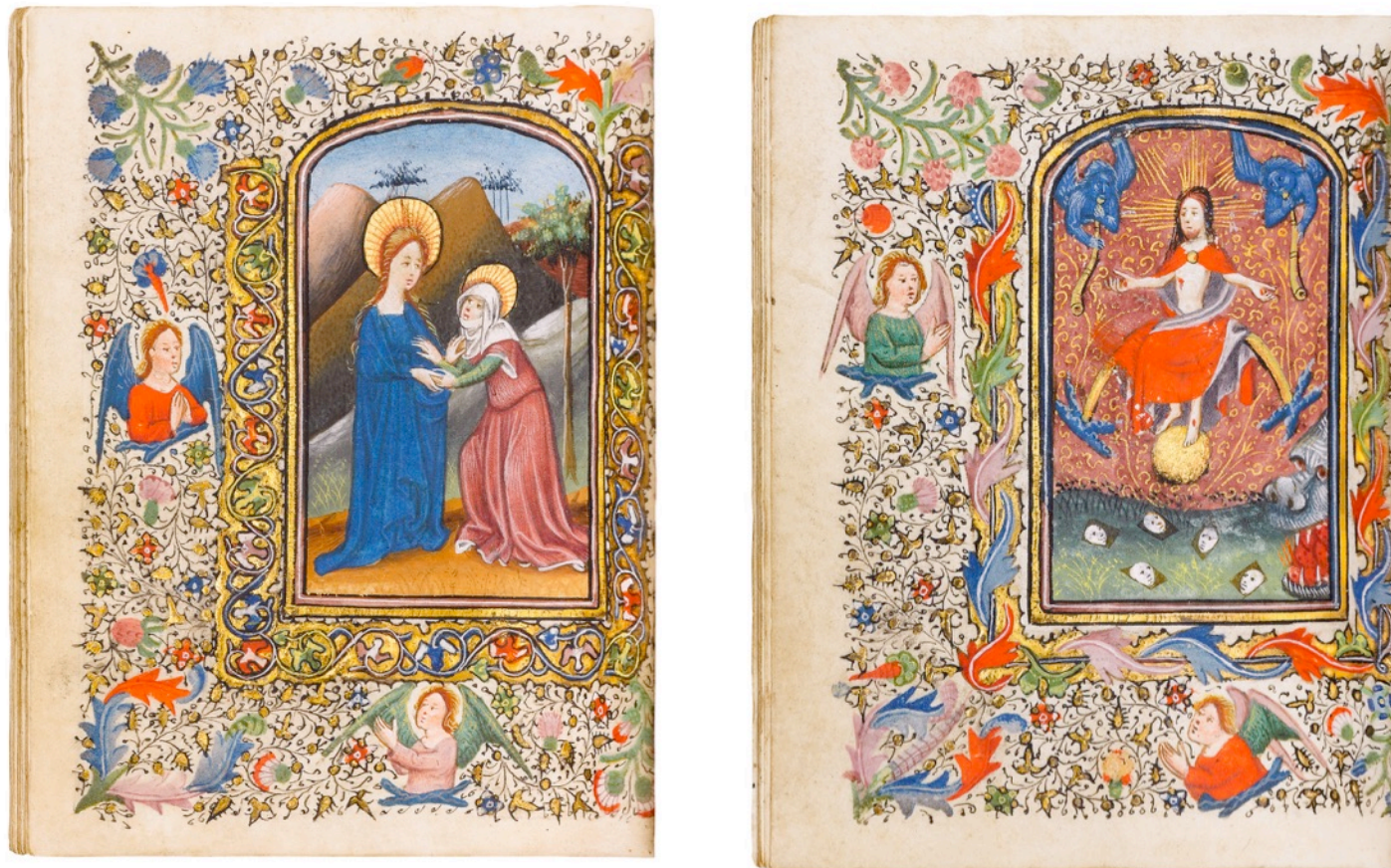
Visitation and Last Judgement, in: Book of Hours, made for the Venetian Zane family Flanders, Bruges, c. 1430-1440 98 x 77 mm, 222 leaves, 21 full-page miniatures with full borders across openings by a Master of the Gold Scrolls Group