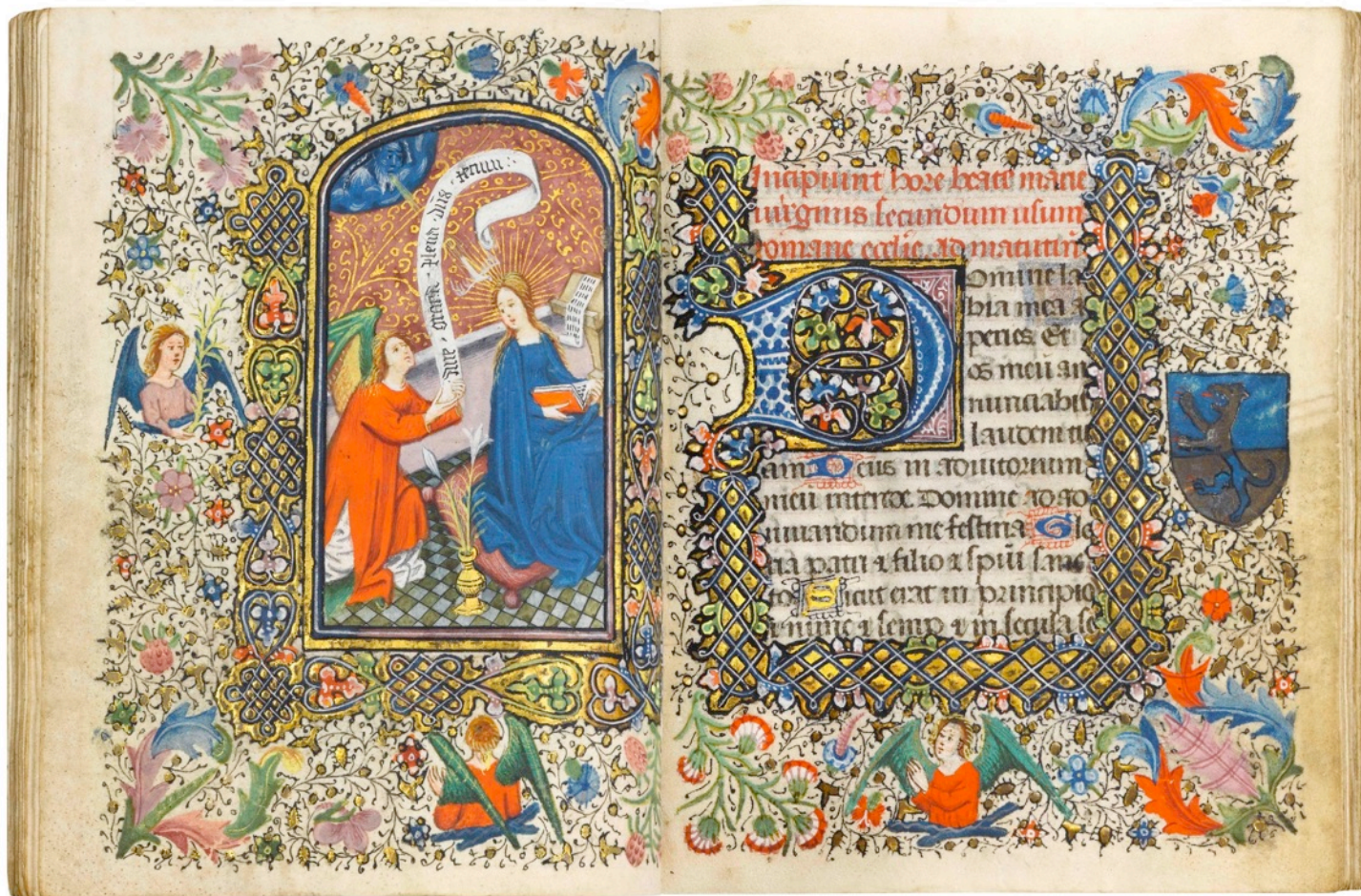
Annunciation, in: Book of Hours, made for the Venetian Zane family Flanders, Bruges, c. 1430-1440 98 x 77 mm, 222 leaves, 21 full-page miniatures with full borders across openings by a Master of the Gold Scrolls Group