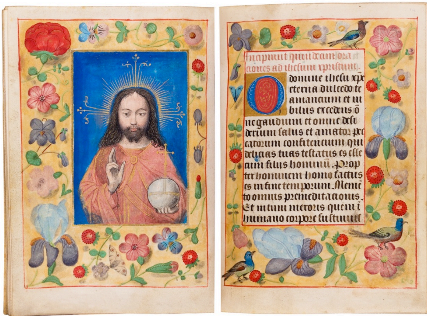
Christ Salvator, in: Aldenham Book of Hours, made for use in England Manuscript illuminated by the Master of Charles V's Officia Salomonis .