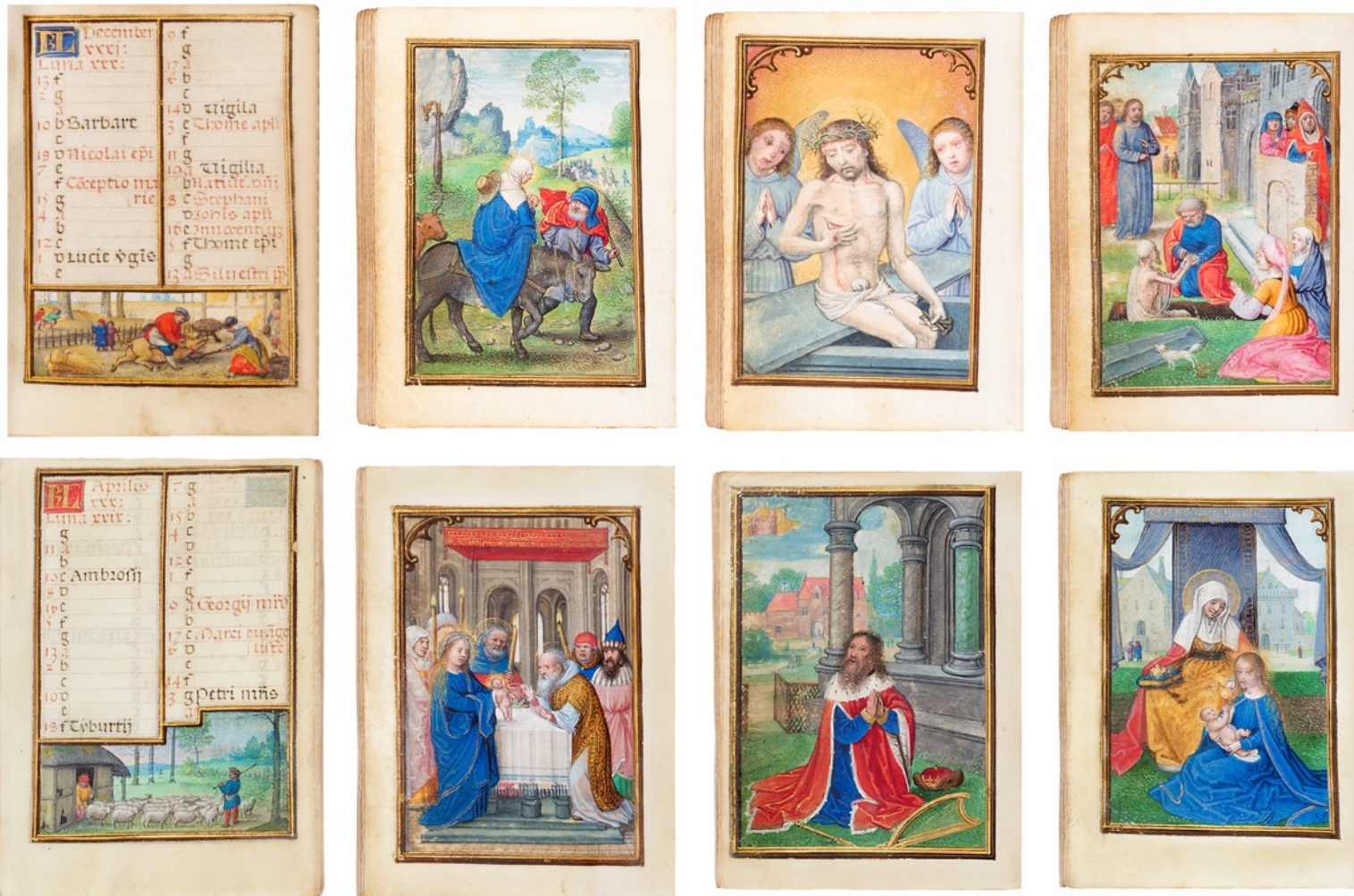
"Miniature" Book of Hours, smallest gem illuminated by Simon Bening, Bruges, c. 1530 59 x 42 mm, 216 leaves, 12 calendar- and 22 full-page miniatures with full borders across openings see for more information the description elsewhere on this website (Gallery)