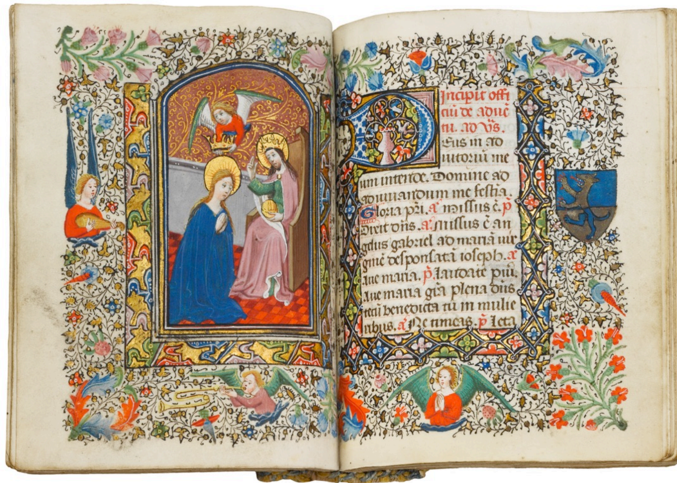
Coronation of the Virgin, in: Book of Hours, made for the Venetian Zane family Flanders, Bruges, c. 1430-1440

98 x 77 mm, 222 leaves, 21 full-page miniatures with full borders across openings by a Master of the Gold Scrolls Group