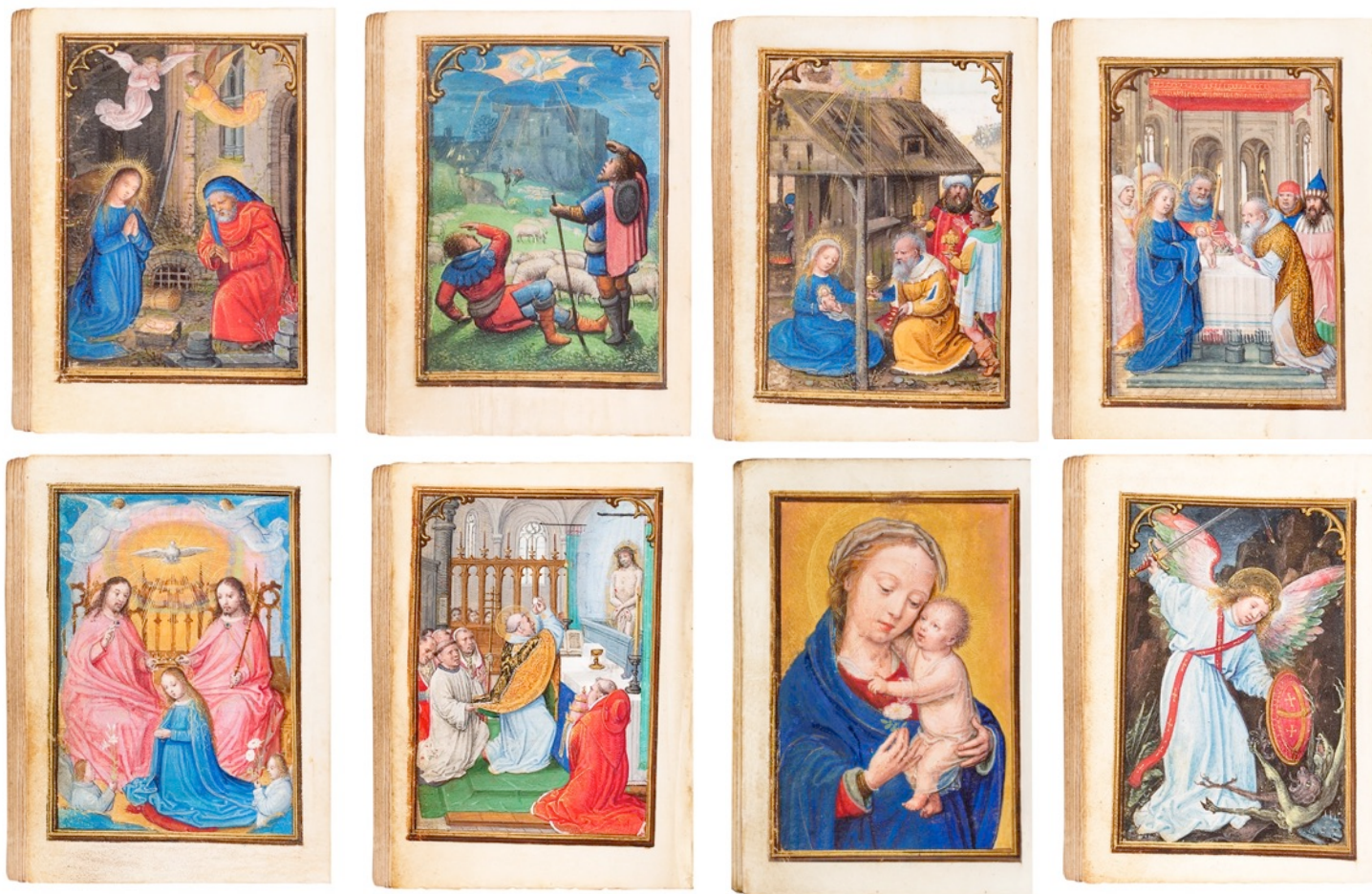
"Miniature" Book of Hours, smallest gem illuminated by Simon Bening, Bruges, c. 1530

59 x 42 mm, 216 leaves, 12 calendar- and 22 full-page miniatures with full borders across openings see for more information the description elsewhere on this website (Gallery)