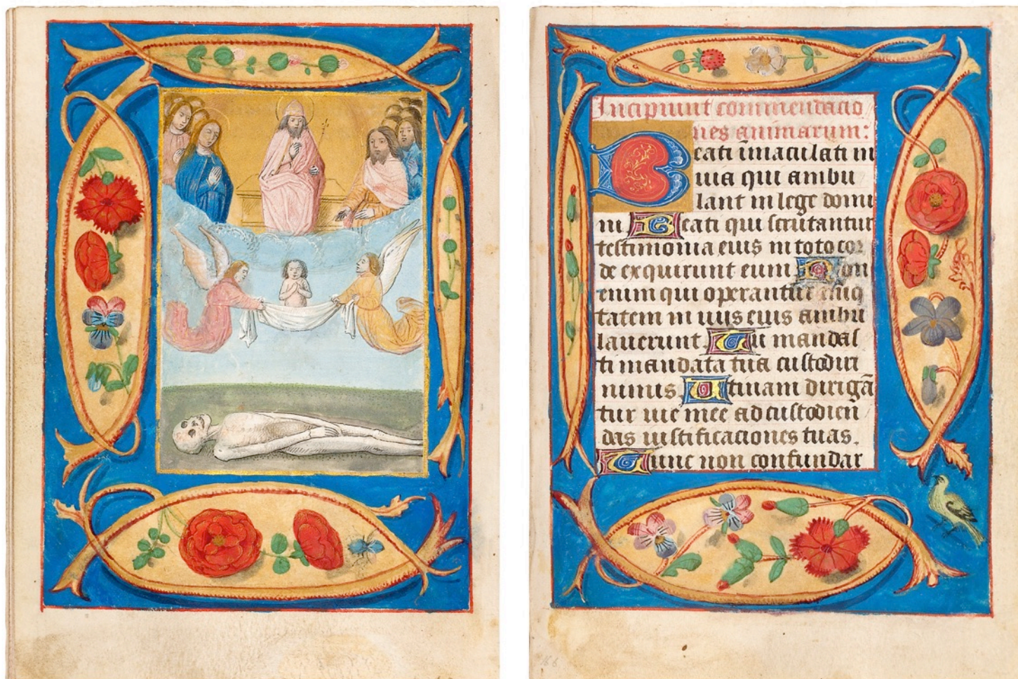
Souls taken to Heaven, in: Aldenham Book of Hours, made for use in England Manuscript illuminated by the Master of Charles V's Officia Salomonis .