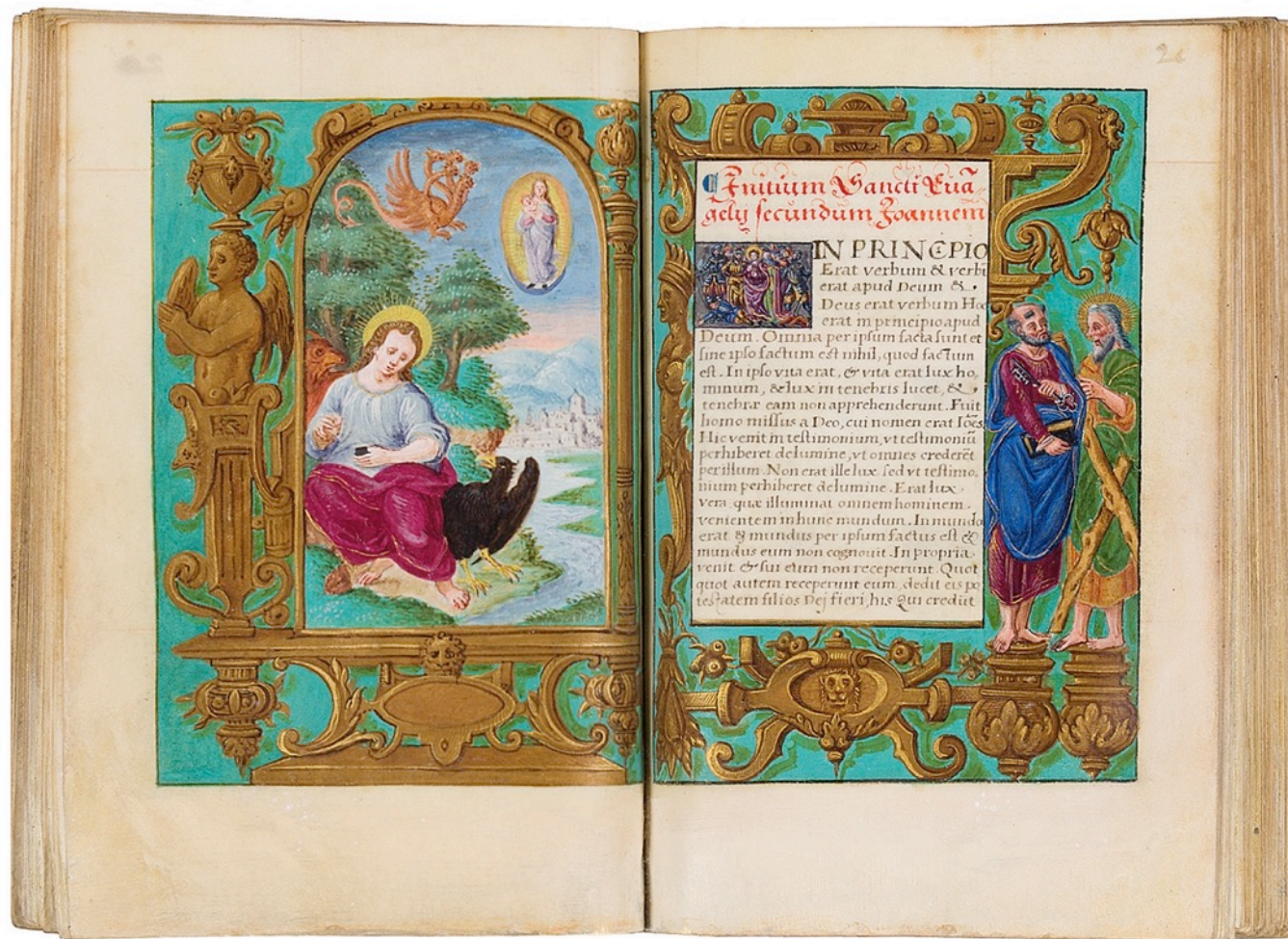
St. John on Patmos, in: Preparationes ante missam... made in the memory of the Croy family, founders of Heverlee Abbey