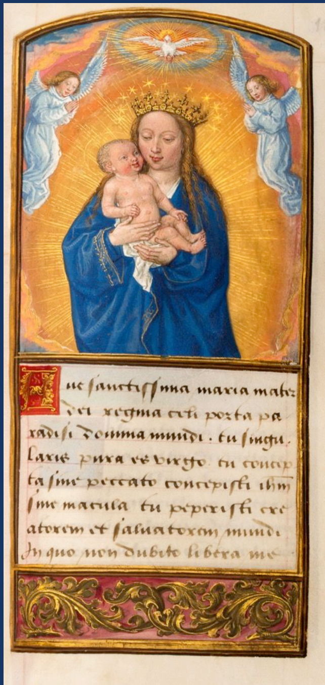
Hours of Charles V, use of Rome, in Latin and French. Illuminated by Gerard Horenbout. Southern Netherlands, Ghent or Mechelen, c. 1520

152 x 75 mm, 181 leaves. Manuscript on vellum, 21 large miniatures in golden frames, with border decoration in Ghent-Bruges style