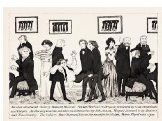
Illustration Art Sale Boasts Advertisements, Cartoons, Fashion, Theater